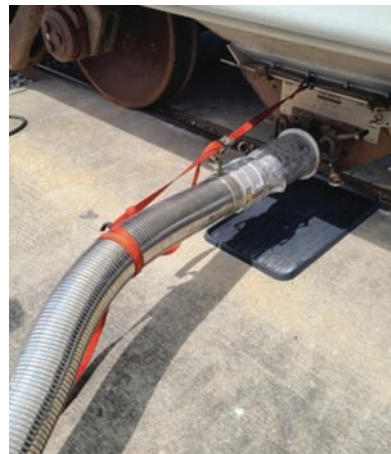
This shows a bulk truck connection to a railcar