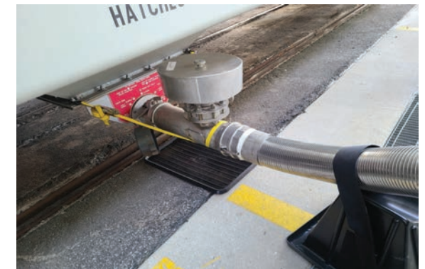
Unloading station with connection support